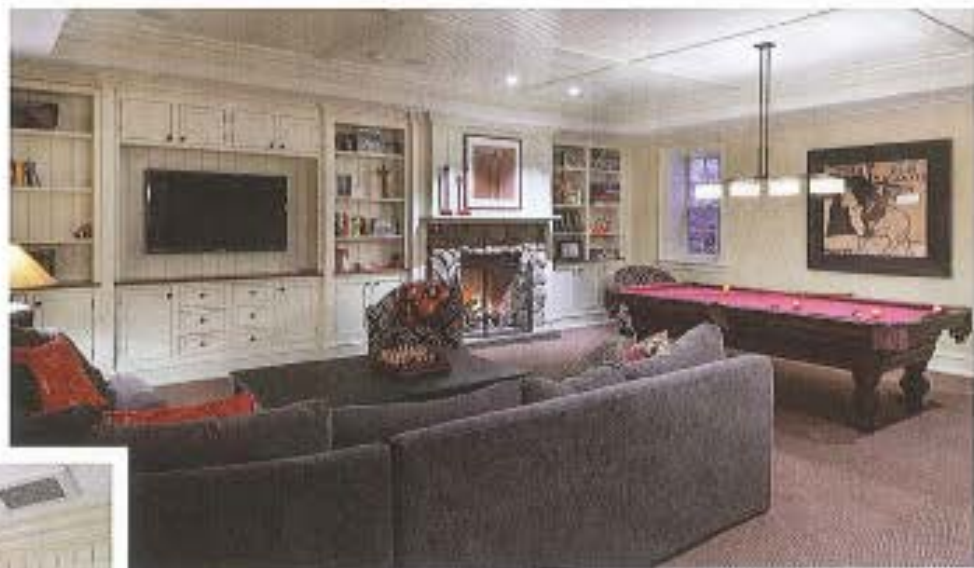
The lower level features a recreation room, a kitchenette, a bathroom and an exercise room.