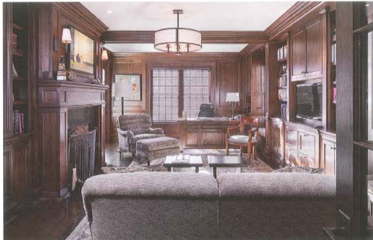
The library and office is cozy and features a fireplace and a wet bar.