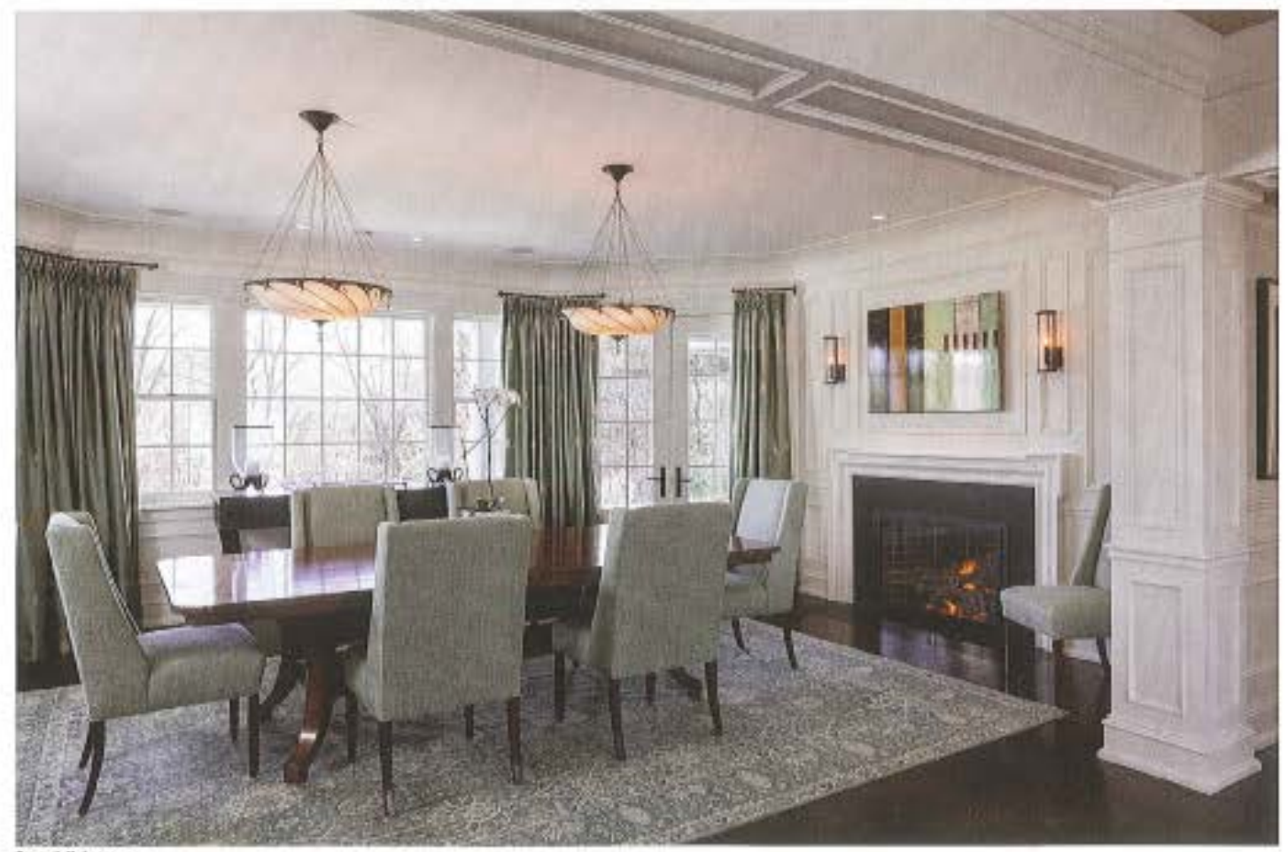
Formal dining room