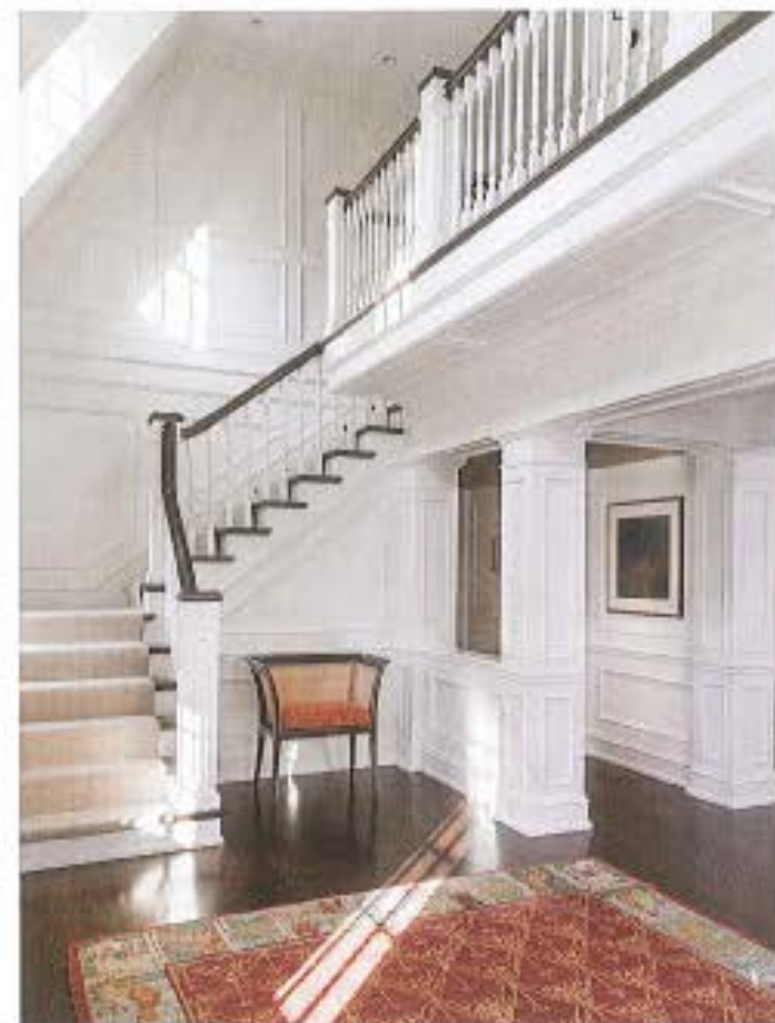
Exquisite detail and craftsmanship are found in every home built by Sunford Custom Builders, Inc.