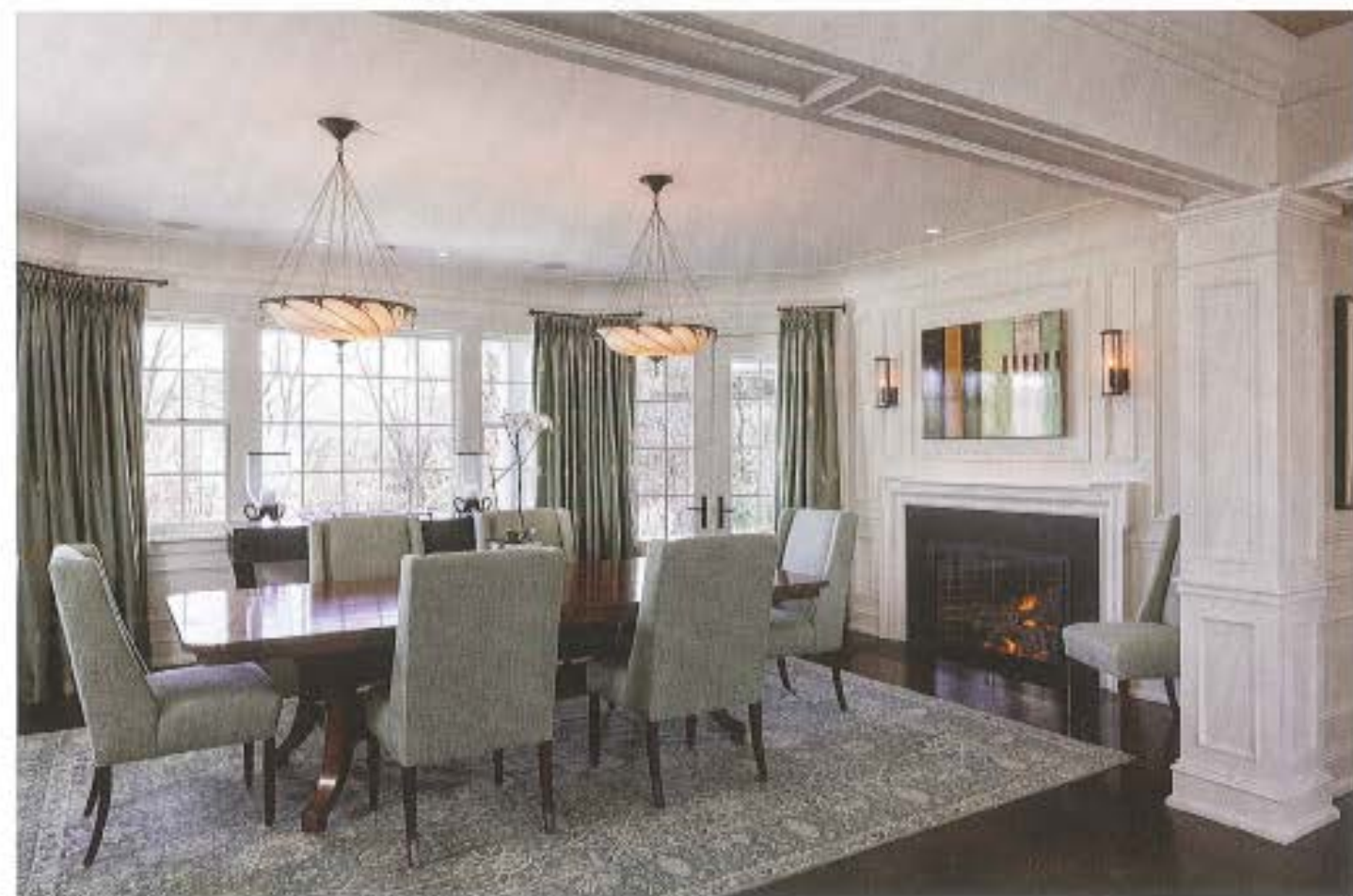
Formal dining room