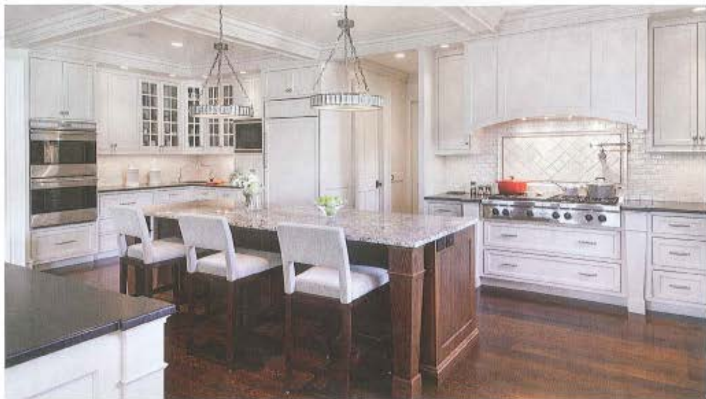
The kitchen leads into a family room, an eat-in kitchen, a bedroom and a sunroom.