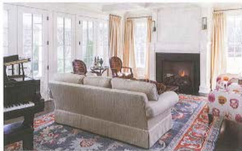
This room off the office is a place for the family to gather to play music and relax.

Understanding that custom home building represents the ultimate realization of a client's often lifelong dream, Kaplan takes an unequivocally personal approach to assuring the utmost quality