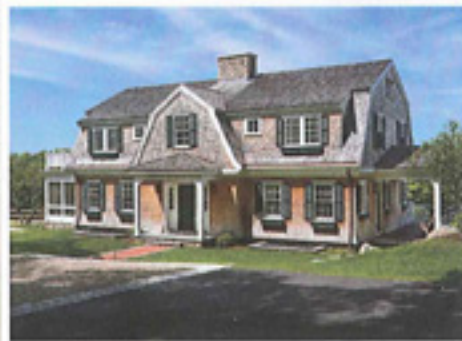
This page; top: French doors can be thrown wide open to enjoy the view. Bottom: The front of the home. At left: The dramatic hallway. Far left: A view of the home from the water.