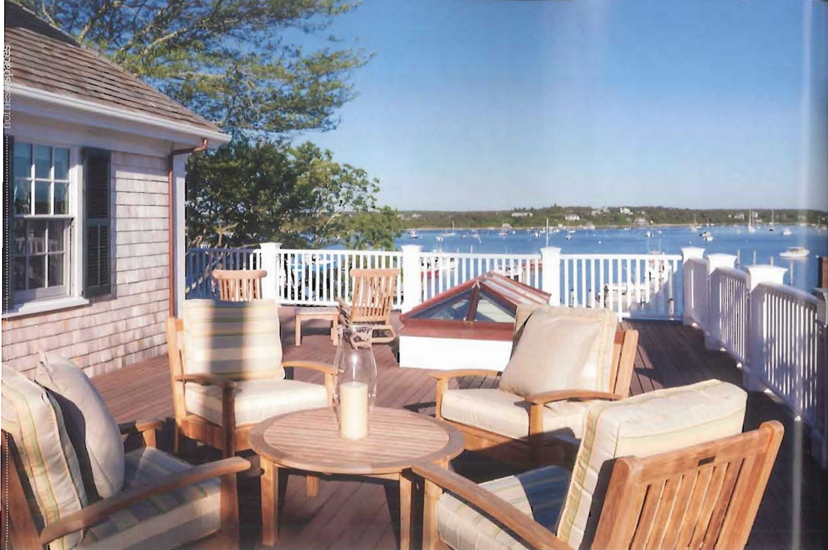
Above: One of the rear decks; it's a prime spot for entertaining. At right: Classic detailing, such as this intricate staircase, can be found throughout the home.