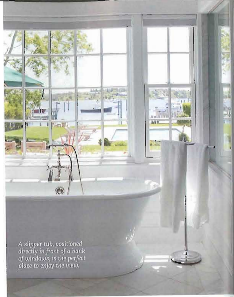
A slipper tub, positioned directly in front of a bank of windows, is the perfect place to enjoy the view.

"Even though the house is just a block away from Main Street in Edgartown, we've created a world of very quiet outdoor spaces," Ahearn said. "The pool kind of floats in a sea of grass, and there are many spots where you can spend the day or the evening relaxing. It was all designed to work with the existing topography and the natural amenities of the harbor."