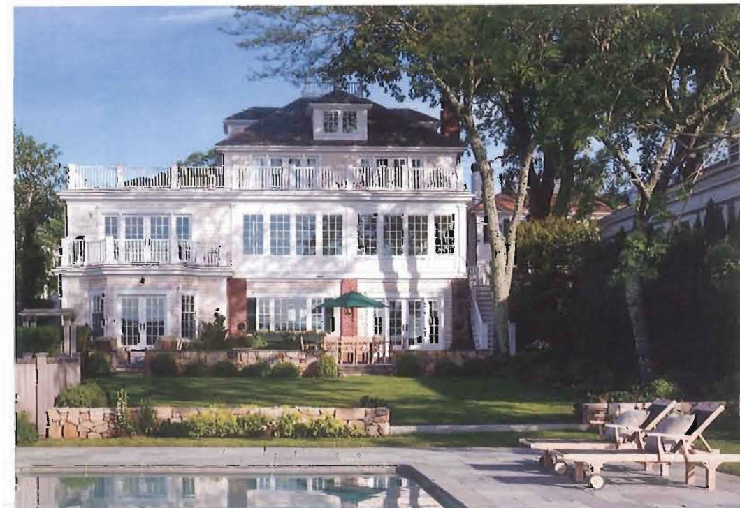
Above: The rear of the beautifully landscaped home overlooks Edgartown Harbor and has decks on two levels. Top: The kitchen opens directly onto a deck with dazzling views of the water.