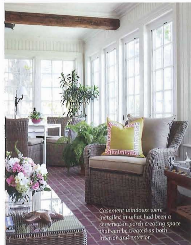
Casement windows were installed in what had been a screened-in porch creating space that can be treated as both interior and exterior.