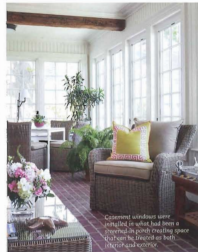
Casement windows were installed in what had been a screened-in porch creating space that can be treated as both interior and exterior.