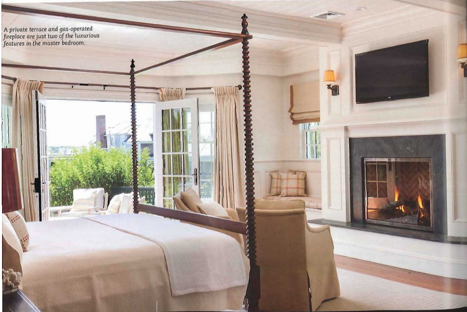
A private terrace and gas-operated fireplace are just two of the luxurious features in the master bedroom.